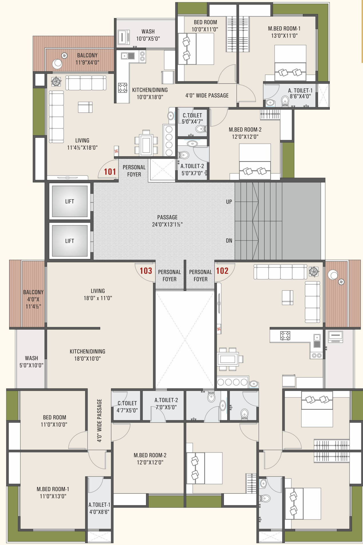
1st To 13th TYPICAL FLOOR PLAN